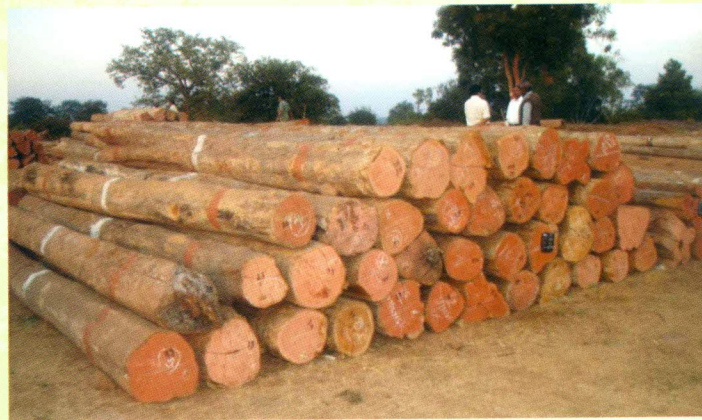
Teak Timber Lot at Ballarshah sale Depot