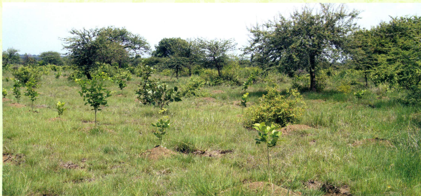
CSR Plantation, 2014 rains in C.No. 518 West Chanda FPD

Approach : Industry/Corporate houses can sponsor above activities through FDCM in co-ordination with Forest Department.