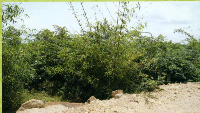
Turnkey Plantation at Juna Kunada - 2013 rains