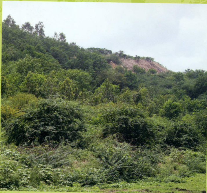
Turnkey Plantation Telwasa - 2011 rains