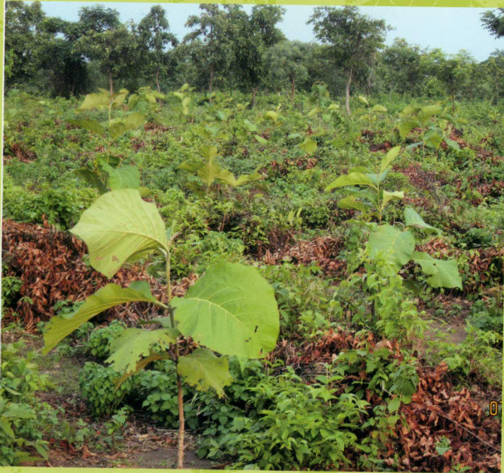
CSR Plantation - 2014 rains Babupeth C. No. 485 / 486