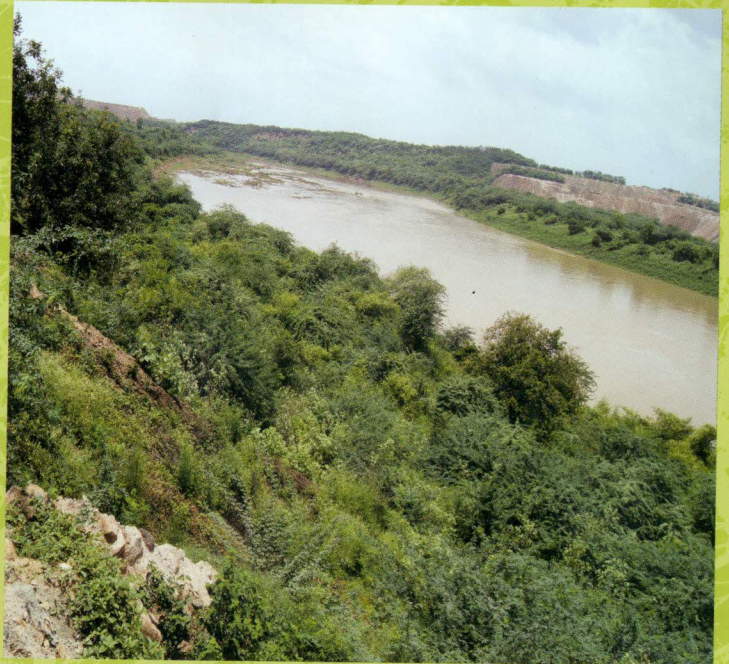
Turnkey Plantation Old Kunada - 2012 rains