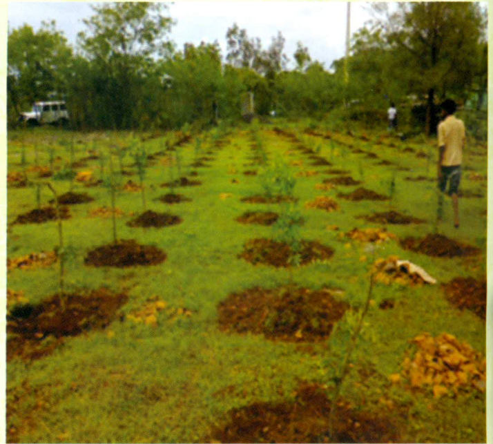
JNTP, Uran Block Plantation