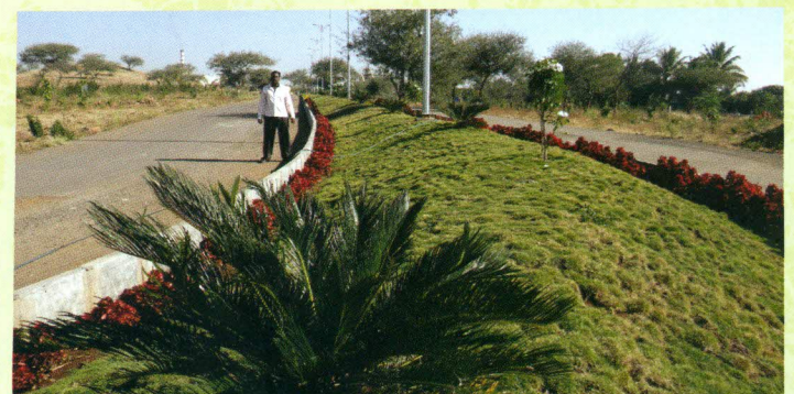
Road Divider Landscaping