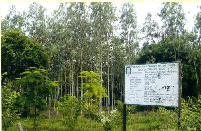
Turnkey Plantation Ordnance Factory, Chanda Plantation, 2012 rains

(23) The profitability of the project would be carefully examined and ensured at the time of preparation of project. Profitability of each project shall be ensured at HQ level. Opinion of CA&FA in this regard, shall be taken.