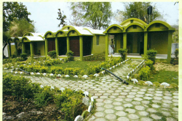
Eco-Tourism Complex, Bor