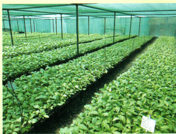
R T Nursery