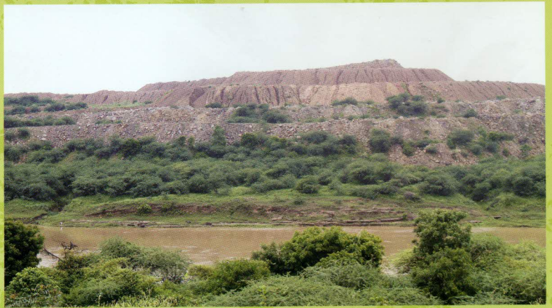
Turnkey Plantation at Kolar Pimpri Dump Yard