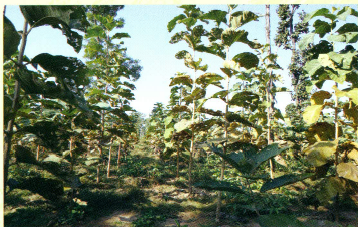
Teak plantation 2012 comp. no. 440 Hiwra Range FPD Nagpur

Ever since the formation of Forest Development Board in 1969, the plantations over 5.30 lakh ha. areas have been raised under various programmes / schemes. These plantations are mainly of Teak & Bamboo in addition to those of Sisoo, Shivan & other miscellaneous species.