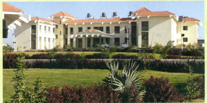
Sahyadri Floral Bio-Park at Kundal