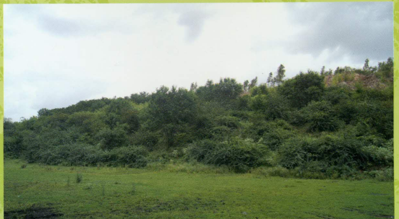
Turnkey Plantation at Dhorwasa - 2011 rains