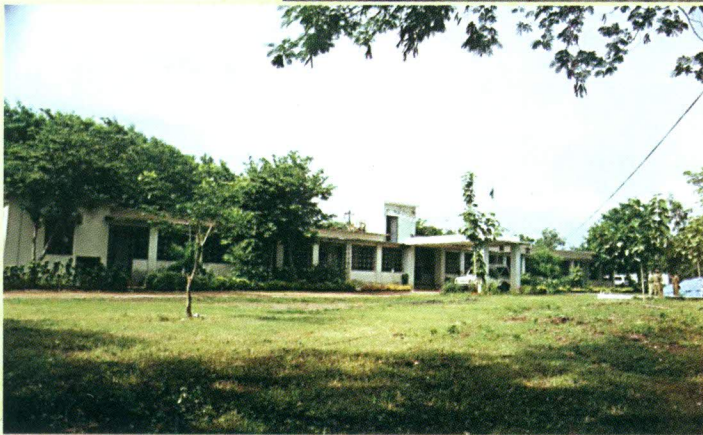
Seed Unit, Nagpur