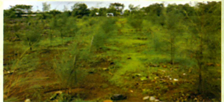
ONGC, Uran Saru Plantation