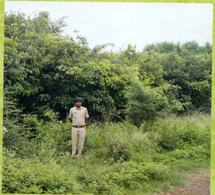
Turnkey Plantation New Kunada - 2010 rains