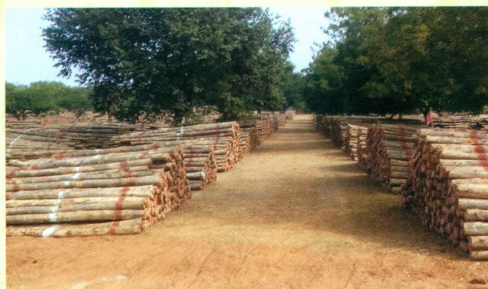
Thinning material at Ballarshah Sale Depot