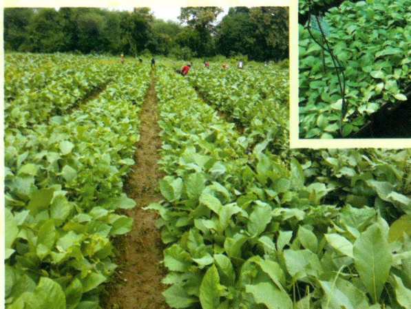
Teak Bed Nursery