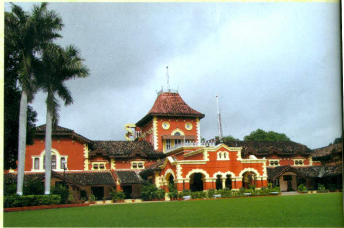
Bio-Diversity Park, Raj Bhavan, Nagpur