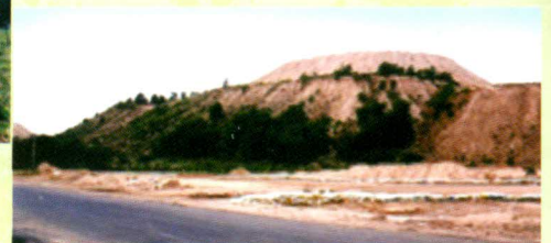
Reclamation of Mining Areas WCL, Chandrapur