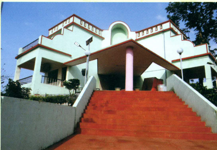
Eco-Tourism Complex, Pitezari

The booking is available on Mahaonline Website: www.mahaecotourism.gov.in for tourists.