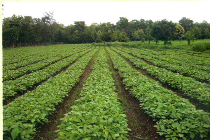
Teak Nursery, Chulband, Forest Project Division, Gondia

ISO 9001-2008 certificate for quality production, sale of teak stumps/plants has been awarded to Chulband Nursery, Gondia.