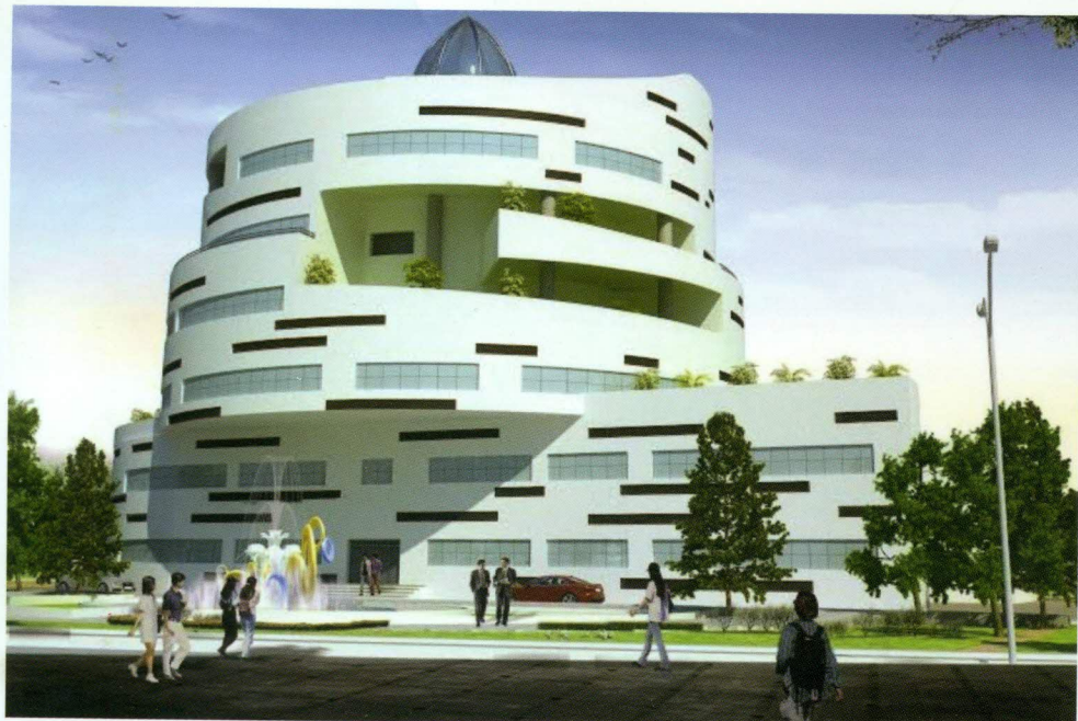
Upcoming FDCM Administrative Building