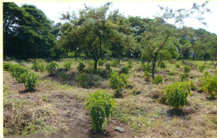
Medicinal species plantation Adulsa ( Adhatoda vasica )