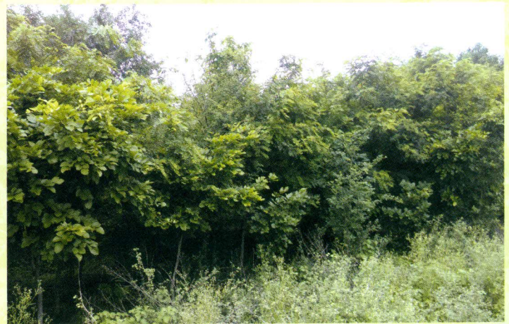
Turnkey Plantation Karnataka EMTA, Chandrapur plantation, 2011 rains